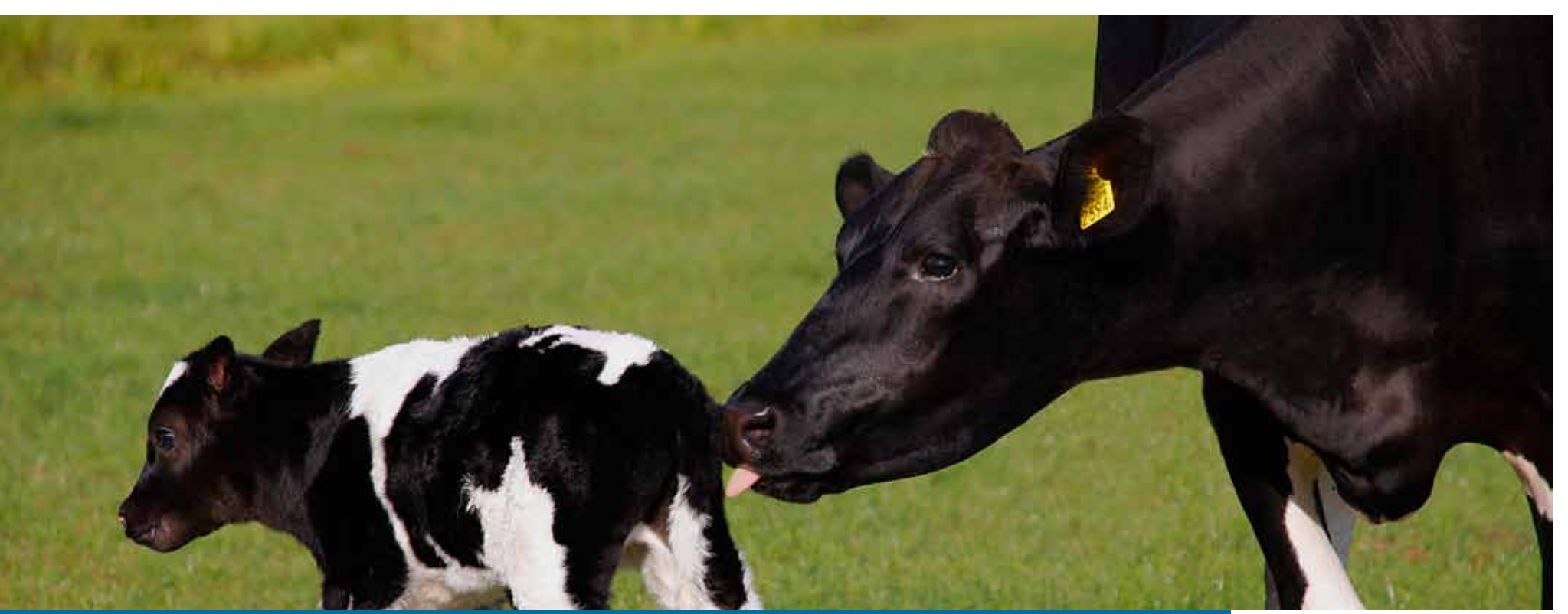
Provimi is committed to UK agriculture for years to come

Provimi is a world leader in the supply of animal nutrition products and services to meet the needs of livestock producers. It has been at the forefront of its industry for more than 80 years and its team of 450 in-house scientists are challenged daily with developing improved animal nutrition solutions. Constant evolution is at the core of Provimi's activities. Provimi continues to be committed to shaping tomorrow's nutrition while respecting the environment and animal welfare and contributing to food safety.